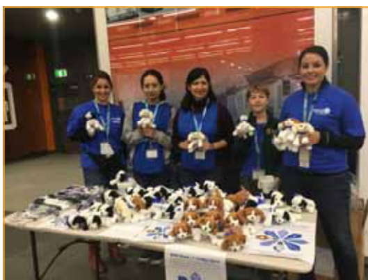
The Chatswood team during MND Week 2017